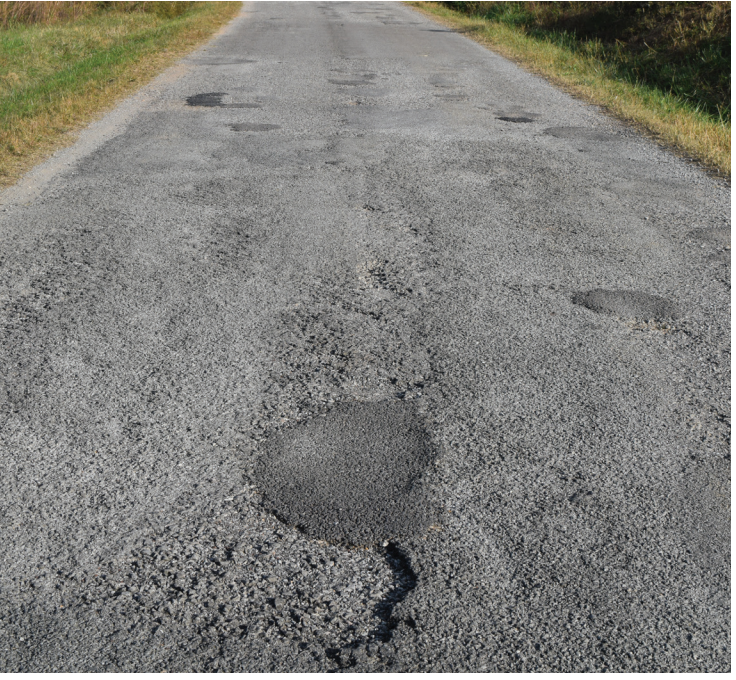
COUNTY ROAD 1600