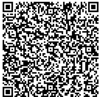
Fraud Seminar Sign Up Link

For a comprehensive list of events, visit our website's Meetings and Events tab.